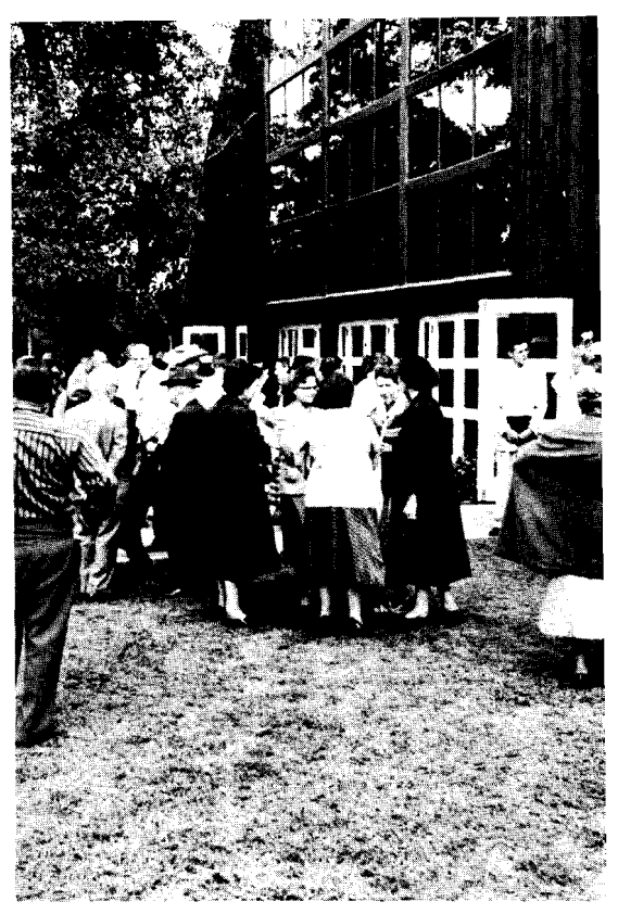
God's people relax in friendly conversation after lunch at the Tabernacle site in Big Sandy, Texas.

These problems have been solved and brought under control now. But they were brought about by the SELF-ISHNESS, GREED AND THOUGHT-LESSNESS of God's People. Let's be sure it doesn't happen again. Be sure you are not guilty of mis-using your tithe.