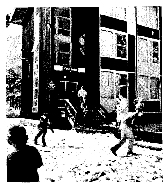
Children at play in Squaw Valley. God has provided His people with breath-taking scenery and lovely surroundings in which to enjoy His Festivals.

You need to figure the total number of miles you drive each year. Then figure what percentage of those miles